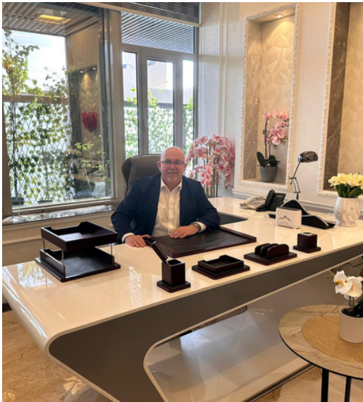
Our New Office in Riyadh

The Leading French Business Consultant in Saudi Arabia!