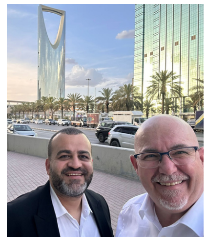
Located near the prominent Kingdom Centre Tower

The substantial growth and opportunities within the Middle East have become evident. The promising opportunities in Saudi Arabia drive our expansion into the region. Our decision to expand in KSA is driven by our commitment to leverage the market's potential and deliver greater client satisfaction.