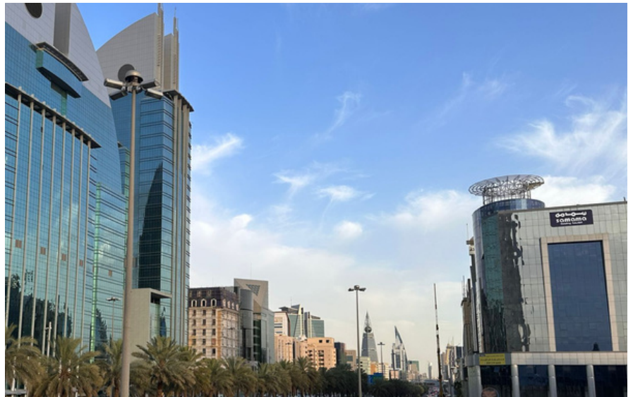
Our building Leaders Towers