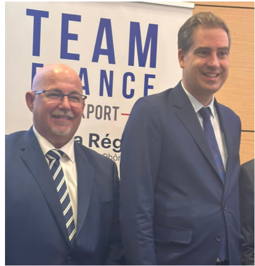
Mr. Labry with Mr. Olivier BECHT, French Minister of Foreign Trade during the Launch of New French Export Plan